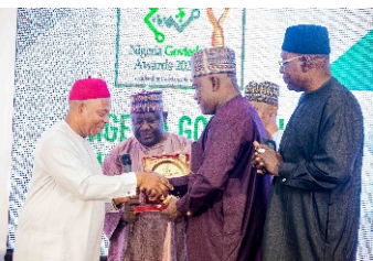
Hon. Commissioner for Inter Governmental Affairs Borno State receiving the Govtech Award