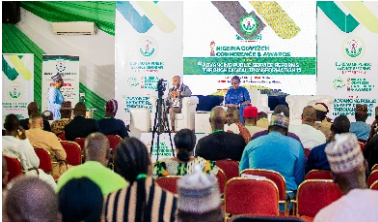
Cross Section of Participants at the Conference