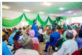
Group Syndicate sessions at the Conference