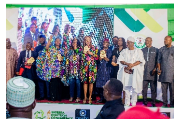
The Cross Section of Edo State Contingents at the conference while receiving the Award of Best State Government in ICT Adoption