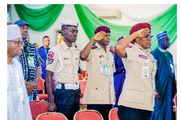
Cross Section of Paramilitary in Attendance