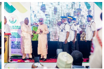
Cross Section of Paramilitary in Attendance