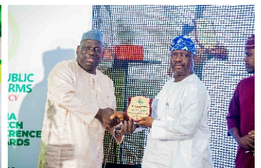
DC, National Oil Spill Detection and Response Agency receiving the Best Federal Agency Mobile Application Award