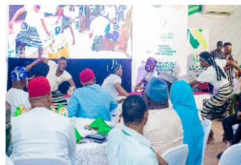
Cultural Dance by the Art Troupe